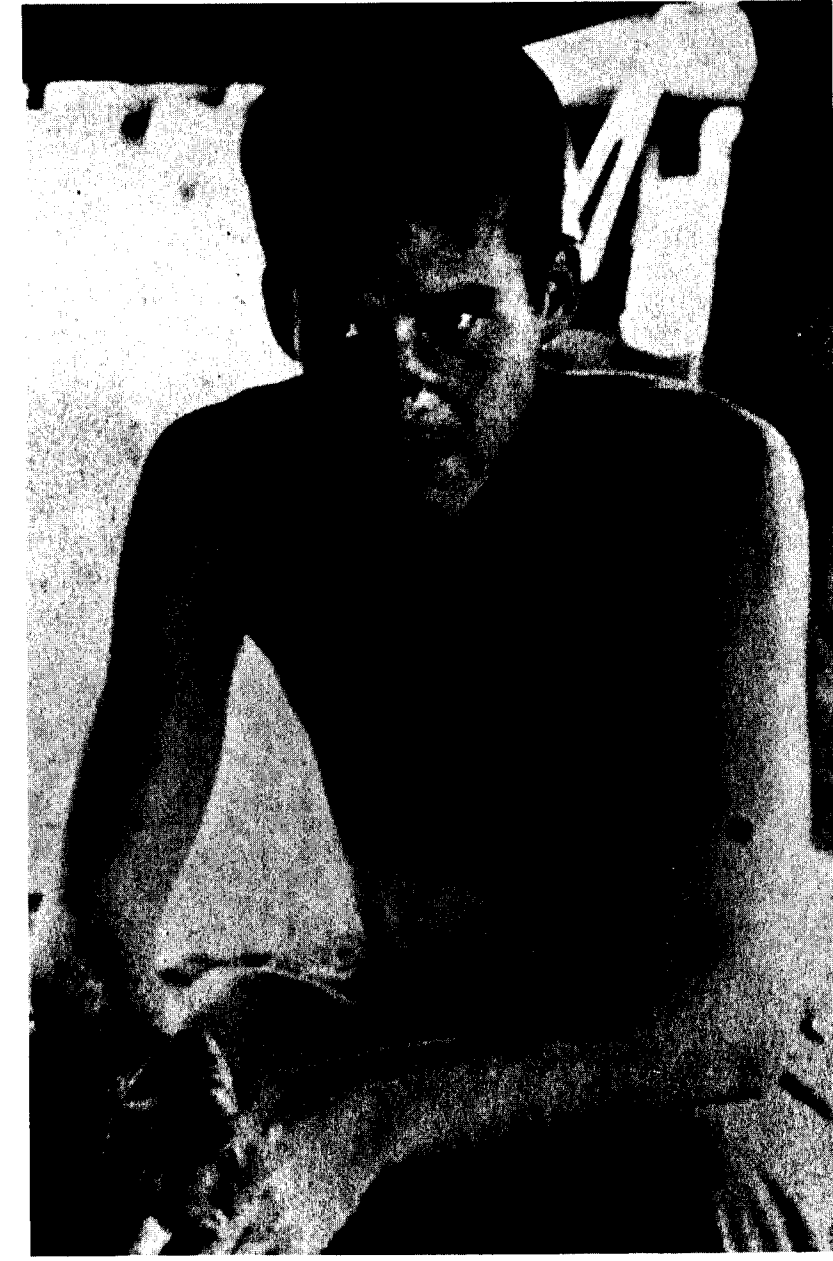
Author at the end of the campaign. Tent camp on Okinawa.

*The 1st Marine Division received the Presidential Units Citation for its part in the Okinawa campaign.