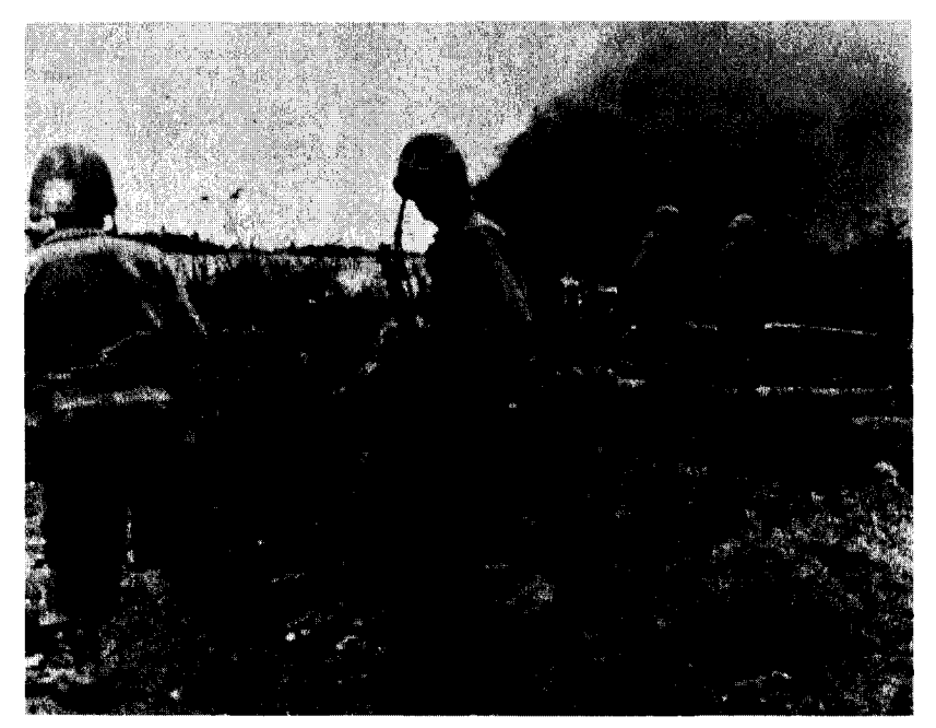
Ngesebus: Assault troops (K/3/5) move inland.