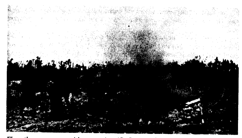
Flamethrower gunner with supporting rifle fire team burns out enemy emplacement. Peleliu.

My carbine was already up. When he appeared, I lined up my sights on