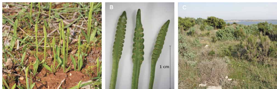
Fig. 2. Habitus (A), sporangia (B) and habitat of Ophioglossum lusitanicum L. on Kamenjak (C).

It is noteworthy that habitats of Cape Kamenjak, one of the richest localities of least adder's-tongue in Croatia, are regularly disturbed by grazing, tourist visits and even military exercises (performed yearly in autumn). A recent study on the effect of trampling on some rare species on the French island Quessant has revealed that O. lusitanicum favours low-medium intensity of trampling (KERBIRIOU et al. 2008). It has been found that for successful germination, spores of O. lusitanicum require variable periods of darkness (WHITTIER 1981). Therefore, pushing the spores deeper into the soil by trampling could account for the beneficial effects of this type of disturbance on this species.