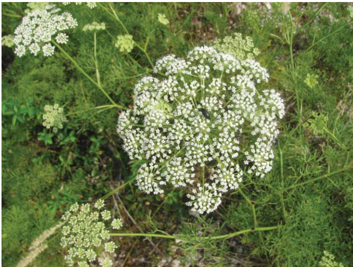
Fig. 1. Ammi visnaga (L.) Lam. (Apiaceae) from Brač (Dalmatia, Croatia).