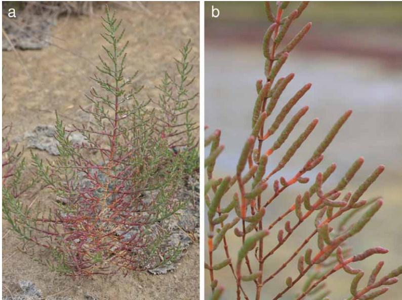
Fig. 3. Plant architecture of Salicornia patula (a) and Salicornia emerici (b).

in saline conditions (Fig. 2c). In each species the germination rate was inhibited and the germination of lateral seeds was especially slowed down with salinity.