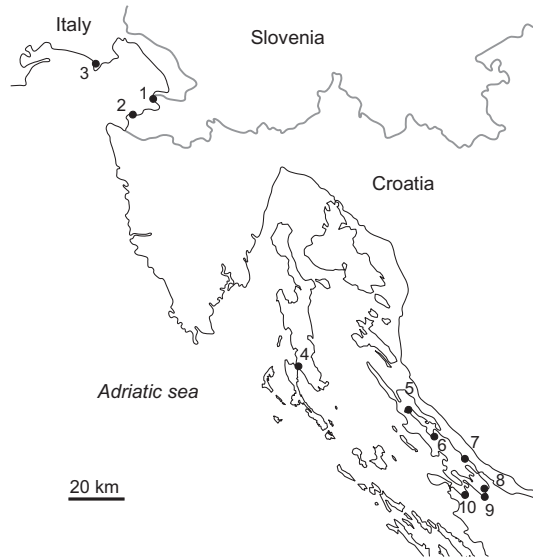
Fig. 1. Plants originating from Italian (3), Slovenian (1, 2), and Croatian (5–10) Salicornia populations.