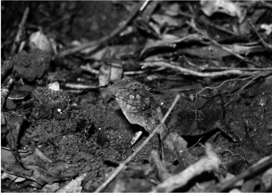
Fig. 1. During the disturbances it expanded its gular sac and looked around.