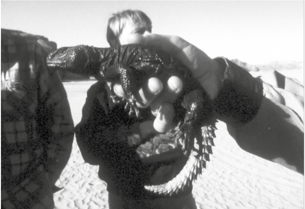
Fig. 1. Uromastix alfredschmidti from southern Akakus.

museum specimens. The only precise locality known by the authors was the type locality: “ Tassili N’Ajjer, Tamrit Plateau (1600 m) [N24°38’ E9°40’], ca. 30 km nord-östlich [= north-east] von Djanet ”. The four paratypes came from vague localities: “Hoggar”, “Tassili N’Ajjer” and “Sahara”. Moreover a Libyan record from “ Südlicher Akakus ” [= southern Akakus] is reported in the map by Wilms and Böhme (2000), on the basis on a photographic record by Heiner Rohrwick (Fig. 1). During the study of the herpetological collection of the Rome University “La Sapienza” (now deposited in the Museum of Zoology of Rome municipality, MCZRV), two authors (AV and RS) found an adult specimen of an indetermined Uromastix (MZUR R/380, provisional collection number) collected by Giuseppe Scortecci in October 1936 in “ Fezzan Occidentale, Tassili ” [= Western Fezzan, Tassili] (Fig. 2). This specimen was identified as U. alfredschmidti (identification confirmed by TW) and it is the first Libyan museum specimen belonging to this species.