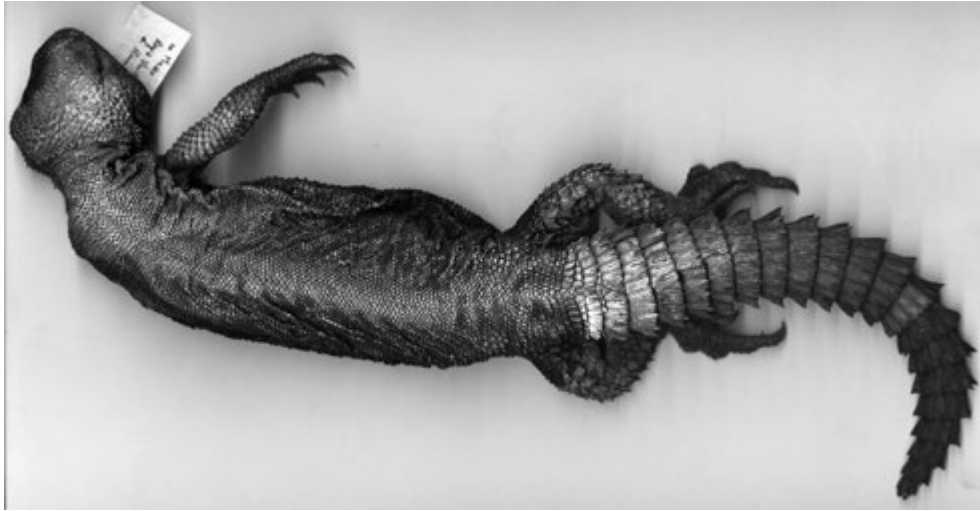
Fig. 2. Uromastyx alfredschmidti . MZUR R/380. Libya, “Fezzan Occidentale, Tassili”, Giuseppe Scortecchi leg., October 1936.

released at the site of capture. A photograph of this specimen was published by Sindaco and Jeremčenko (2008: 432).