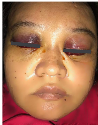
Figure 1. Swelling and erythema at bilateral palpebral