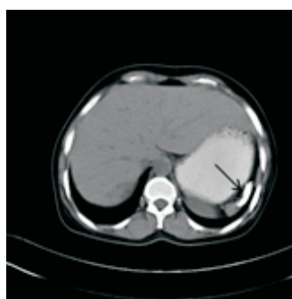
Figure 3. Axial plain CT scan image showing a calcified mass in the splenic fossa.