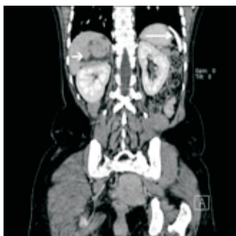
Figure 4. Coronal MPR image showing the supra renal mass (short arrow) and the calcified mass in the splenic fossa (long arrow). Note that the spleen is not visualized in the splenic fossa.

Blood examination revealed hemoglobin of 8.4 gm/dl and red blood cell count of 3.02 \times 10^6 /microlitre. The mean corpuscular volume, MCH and MCHC were 81.7 fl, 27.8 pg and 34.0 gm/dl respectively. Few target cells and sickle cells were also seen. Hemoglobin electrophoresis revealed an Hb S of 86.4%, Hb A2 of 3.3% and Hb F of 6.5% thereby confirming a diagnosis of sickle cell anemia. At the time of submitting the case report for publication the patient is undergoing pre surgical workup for removal of the adrenal tumour.