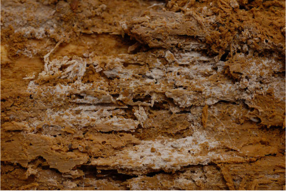
Fig. 2. Lawrynomycetes capitatus – young basidiomata on very rotted wood of Pinus sylvestris stump. Coll. Karasiński 2744 (Herb. D.K.).