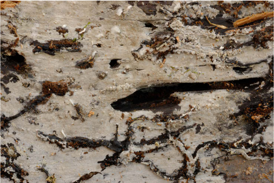
Fig. 3. Lawrynomycetes capitatus – mature and well developed basidiomata on much rotted wood of Picea abies stump. Coll. Karasiński 970 (KRAM F-56623?).