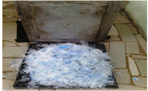
FIGURE 2. Pulverized waste water-sachets.