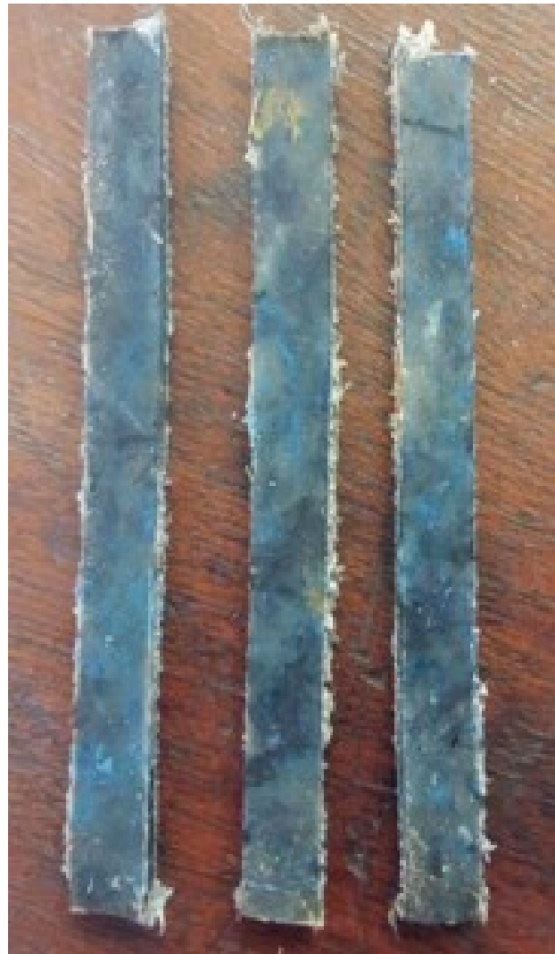
FIGURE 5. Impact Test Specimens.

It was observed in Table 1 that there was a decrease of 35.24% in the average percentage elongation of the RLDPE/IC mat composite when compared to the RLDPE and an increase of 28.74% when compared to the RLDPE/IC particulate composite. With the incorporation of the IC mat/particulate in the polymer, the elasticity of the composite is suppressed. The reduction is attributed to the decreased deformability of the rigid interface between the IC mat/particulate and the matrix material [2, 3]. The decrease in elongation at break is due to the destruction of the structural integrity of the polymer by the fibres and the rigid structure of the fibres [15]. The higher value of the average percentage elongation recorded for the RLDPE/IC mat composite over the RLDPE/IC particulate composite was as a result of the mat's long-fibres being