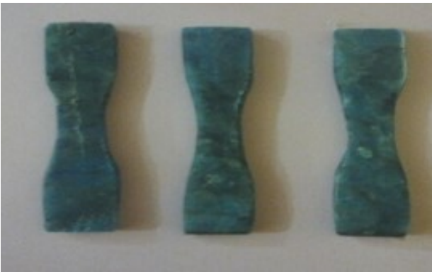
FIGURE 4. Tensile Test Specimens.

tensile modulus is also due to the fibres itself, which have a higher stiffness than the polymer [2, 3, 14]. The IC stem is more rigid in its original form than when pulverized into particulate, hence, there is a more rigid polymer/IC interface in the long-fibre mat form resulting in a higher value for the average tensile modulus recorded for the RLDPE/IC mat composite over the RLDPE/IC particulate composite.