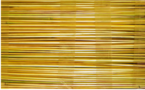
FIGURE 1. IC Mat.