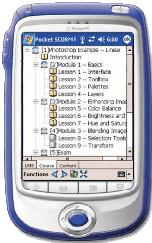
Fig. 3: E-learning course on a PDA

At the insertion of web pages, the HTML code between the “<body>” and the “</body>” tags are inserted. As in the case of raw text, the automatic text wrapping of the browser provides a proper appearance on small displays.