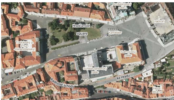
FIGURE 4. Location of the monastery on a steep south side of the castle promontory between Prague Castle Square and Radniční schody (Town Hall Stairs).

Therefore Carmelite nuns have addressed SPELEO-Řehák company, specialized in rehabilitation of drainage systems and associated failures in historic buildings. During the subsequent structural surveys serious problems, that were causing the stability disruption, were revealed.