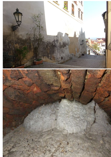
FIGURE 6. Carmel Monastery: Radniční Schody (Town Hall Stairs) - spalling of the plaster due to water-saturated backfill, the gallery clogged with concrete.

Restoration of traditional systems of protection of buildings from water and moisture should be pri-