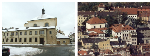
FIGURE 1. Carmel Monastery in the Prague Castle Square, view to the southern terrace of monastery.

Protection of buildings from water and moisture relates to the most important measures in ensuring the service life and serviceability of buildings. Of great importance, as well, is structural solution of the designed rehabilitation procedure. Unqualified interventions and measures often lead to failures and in the final phase, the deterioration of the whole complex. For this reason, the problems of long-term efficiency and reliability of rehabilitation methods are becoming a subject of great interest, both in terms of research and practical applications. The focus is mainly on listed buildings where technological designs are the most complicated.