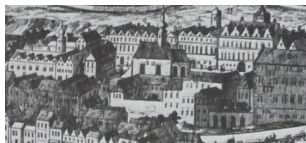
FIGURE 2. Carmel Monastery - View of Prague by F. van Ouden Allen, 1685.

The Monastery of Discalced Carmelite nuns (the Carmel of Saint Joseph) is located on the Prague Castle Square. A part of the monastery grounds is the St Benedict's Church, first mentioned in 1353, later the church underwent a number of reconstructions. In 1626 the monastery complex was added to it. Its present form dates back to the middle of the 18 th century. The Carmel Monastery was built on a steep south side of the castle promontory (Fig. 1 and 4). The subsoil consists of weathered clay schist, which are unstable and slushy. In the Middle Ages a number of drainage and ventilation systems had served to prevent penetration of moisture into the structures, they drained water and dampness out of the structures and maintained them reasonably dry [2]. The Baroque monastery buildings were forcibly abandoned in 1950 and the entire complex was costly adapted for use as a luxury hotel. Between 1985 and 1991, the monastery underwent extensive reconstruction and was returned to its original religious purpose in 1992.