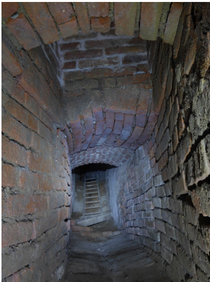
FIGURE 7. Carmel Monastery: reconstructed main gallery.

Investigation involving the testing of rehabilitation methods and procedures in existing buildings is apparently the most reliable approach for obtaining conclusive results on the effectiveness of damp-removal measures. The experimental testing is useful not only for the assessment of the efficiency of remedial technologies, but also for a deeper investigation of moisture transport phenomena [4]. This appears an attractive way for better approaching the real features of building materials and, at the same time actual climatic conditions experienced on site. The phenomenon of moisture movement is extremely variable from case to case, depending on the specific features of the masonry: direction, quantity and continuity of water supply from ground, depending on seasonal and accidental factors, evaporation condition, thickness and arrangement of the bricks in the masonry, nature of mortar joints etc. [4].