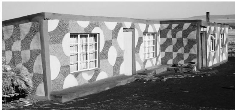
Figure 3: An adobe house in Tsiame near Harrismith

smaller (subset) sample in each of the areas, equally distributing the larger and smaller samples across the two Survey waves.