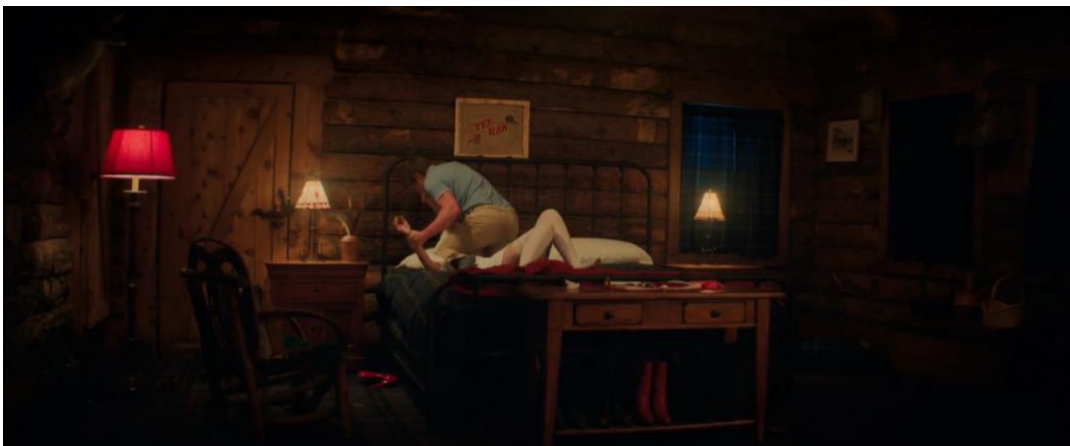
Figure 3. Al suffocates Cassie with a pillow