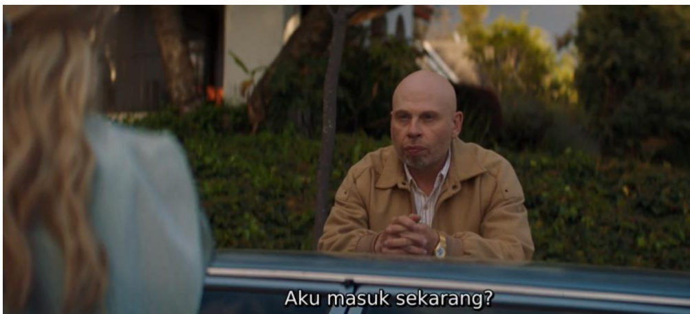
Figure 5. The Hitman

In Figure 4, the camera work focuses on the centre of the room, showing Cassie in the middle of the sofa, with Mr. Green kneeling in front of her. The reason behind his change of behavior is that Mr. Green is on sabbatical. He has had an epiphany that makes him regret his actions for his opponents whom he has wronged, including Nina. When Cassie asked if Mr. Green wanted to be hurt by her, Mr. Green resigned himself to accepting the offer to be hurt because he felt he deserved it. Cassie had originally prepared a hitman to torture Mr. Green, who was outside his house.