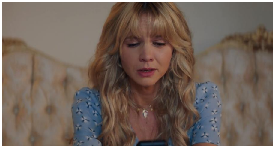
Figure 2 Cassie saw the video

Fast forward in the film, Maddison, Cassie and Nina's colleague, gave a recording of Nina getting raped by Al Monroe. The tape is the living proof of Nina becoming a sexual object and being viewed by others.