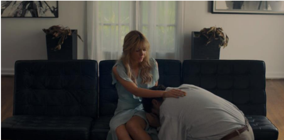
Figure 4. Mr. Green apologized for his behaviour

In Figure 4, the camera work focuses on the centre of the room, showing Cassie in the middle of the sofa, with Mr. Green kneeling in front of her. The reason behind his change of behavior is that Mr. Green is on sabbatical. He has had an epiphany that makes him regret his actions for his opponents whom he has wronged, including Nina. When Cassie asked if Mr. Green wanted to be hurt by her, Mr. Green resigned himself to accepting the offer to be hurt because he felt he deserved it. Cassie had originally prepared a hitman to torture Mr. Green, who was outside his house.