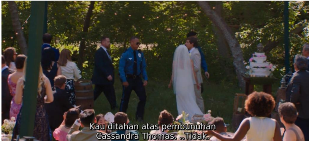
Figure 6. Al got arrested by the police

At the end of the story, Cassie was able to destroy the patriarchal system in this film, breaking down the domination of Al Monroe's power.