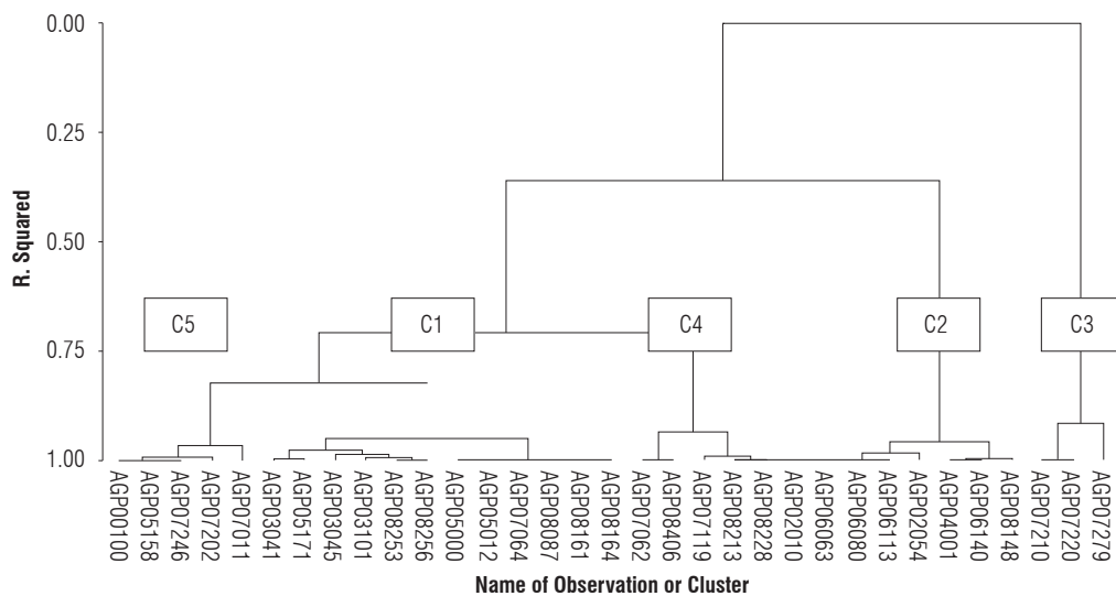
FIGURE 3. Cluster analysis on the sampled lots, according to adoption of oil palm cropping practices.