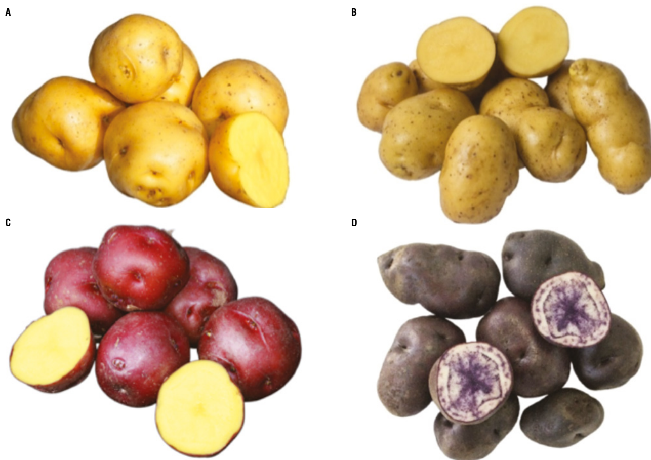
FIGURE 1. Tubers of cultivars A) Criolla Colombia, B) Paola, C) Milagros and D) Violeta.

Tubers of diploid potato cultivars with different colors of skin and flesh were used for this study. The cultivars Criolla Colombia and Paola had yellow skin and flesh; the cultivar Milagros had red skin and yellow flesh, and the cultivar Violeta had purple skin and purple and white flesh (Fig. 1).