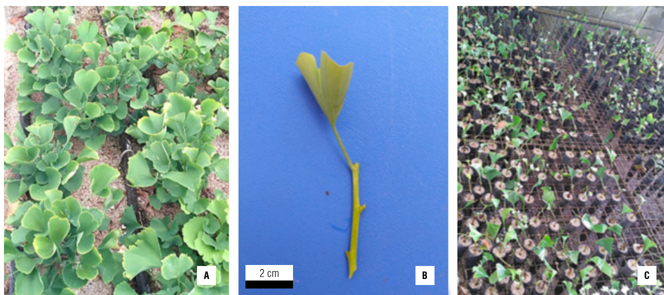
FIGURE 1. A) Mini-stumps, B) mini-cutting, and C) experiment installed in the greenhouse.

After preparation, mini-cutting bases were immersed in the indole butyric acid (IBA) plant growth regulator in