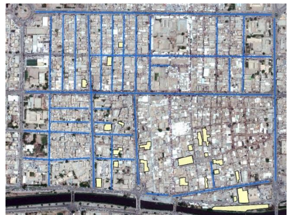
Figure 4. Screen shot for all roads and parks in the study area

The data of this study were collected for the purpose of finding the characteristics of parking in Al-Orzady Street, Al Saray Street, and Almuswreen Street at the evening period. The study does not include standing in the squares. The survey was conducted using the in_out method. Where three ways were chosen in which vehicles are allowed to stop, the survey that was conducted counted the number of vehicles parked on the street at the beginning of the survey, and counted the number of vehicles that parked or left the street at certain periods of time. The Fig 3