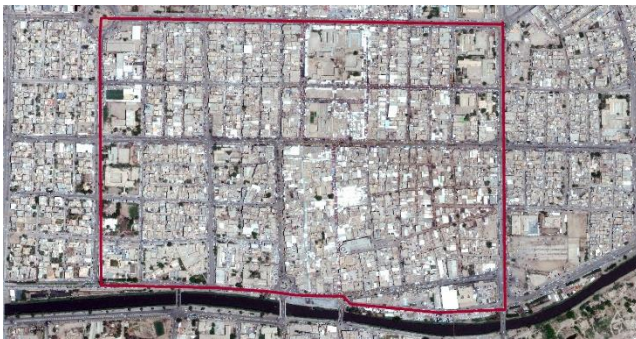
Figure 2. Screenshot for the study area

Then a survey was conducted to determine the number of parked vehicles in all of the streets of Al-city Diwaniyah's centre in the study area, as well as the number of parked vehicles in 22 parking spaces located in the city centre of Al-Diwaniyah. Fig 4 show the location of on street and off street parking lots in the study area.