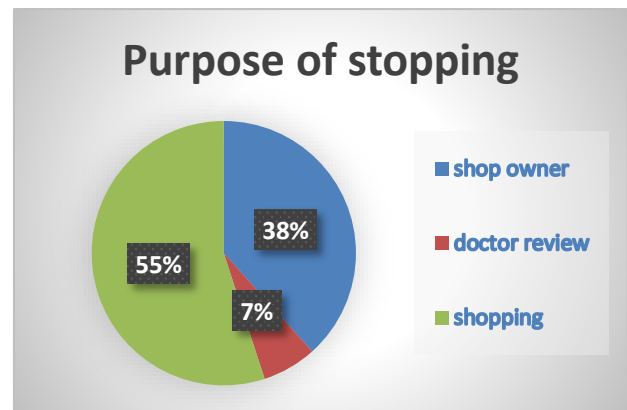
Figure 6. The percentage of purpose of stopping

What was discovered from the questionnaire survey that took place in ST1, ST2, and ST3 to determine the reason for parking the vehicle on the street, as show in the Fig 6.