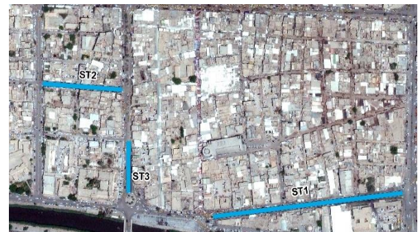
Figure 3. Location on-street parking in the study area

The number of all vehicles parked on and off streets in the study area was calculated at the morning and evening at different days, and the parking sites on the street were chosen using the GIS application, which was also used to estimate the length of the street allowed for stopping. The attributes were ascertained using the in-out survey method. To find out why the car was parked on the street, a questionnaire was also created.