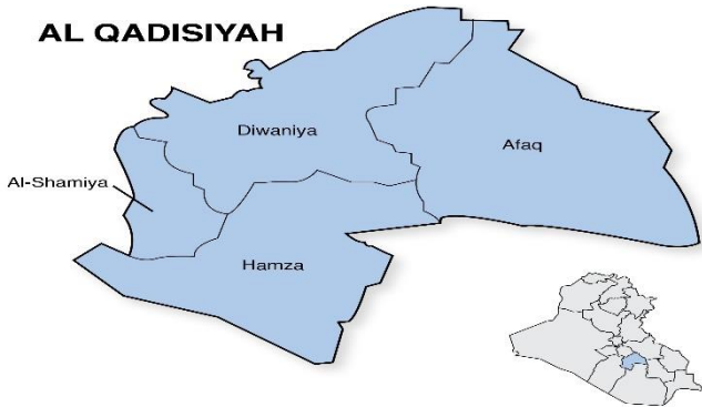
Figure 1. A map of Iraq showing the location of the city of Diwaniyah

It is crucial to get parking information from urban streets in order to research the effects of on-street parking. Al-Orzady Street, Al Saray Street, and Almuswreen Street are the first three locations that have been chosen for this project to study its characteristics in the evening period. In Al-Diwaniyah city, these locations are among the busiest ones on-street parking. Fig 2 show the border of study area.