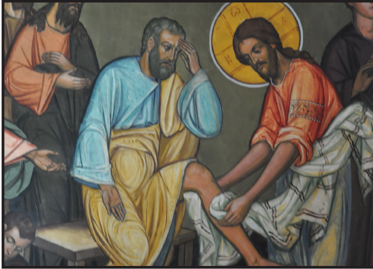
Figure 3: Images of Jesus with the disciples

aware of the story of Jesus washing the disciples' feet. In embodying this metaphor, Sister Irma superimposes the trope of Jesus' humility and devotion on top of her own interactions with her community of elderly peers.