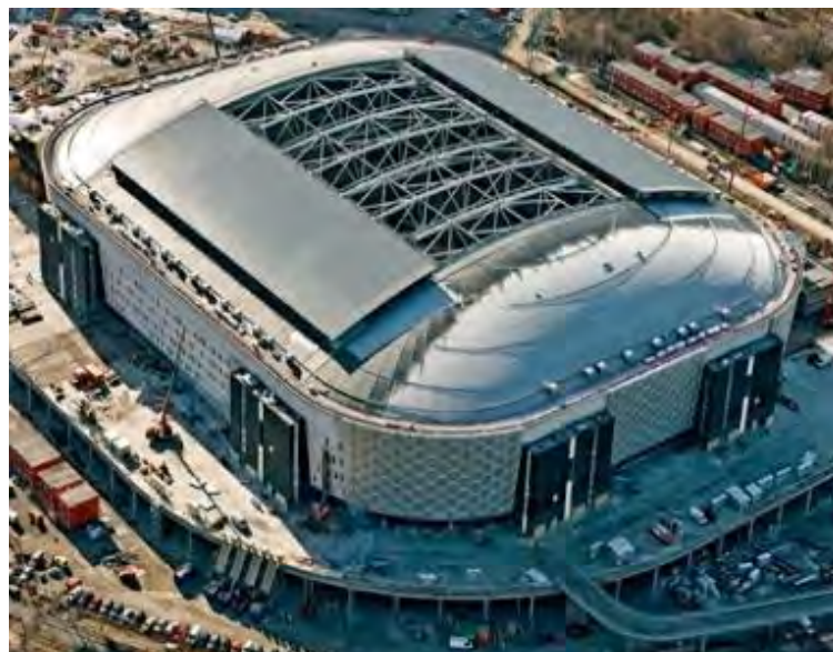
Figure 2. Swedbank Stadium