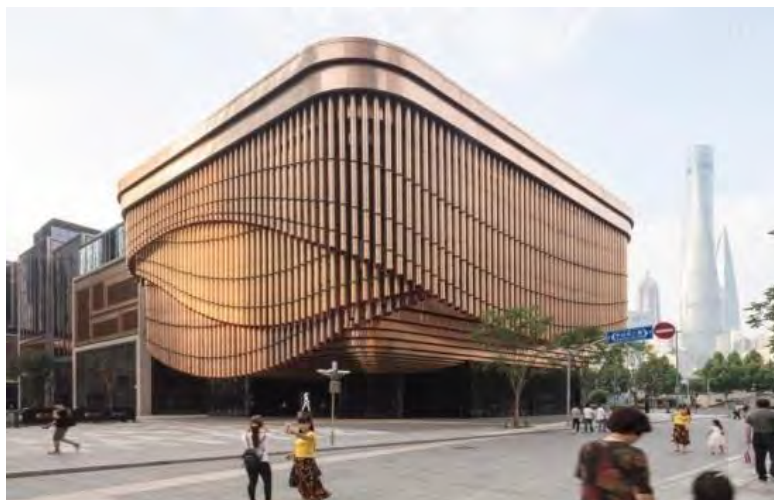
Figure 7. Shanghai theater