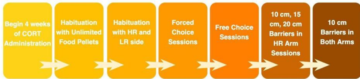
Figure 2. Experimental Timeline. After four weeks of CORT and \beta -cyclodextrin administration to the EG ( n=8 ) or \beta -cyclodextrin only to the CG ( n=6 ), mice were habituated to the maze over the course of two days with unlimited food pellets in the arms. Mice then completed an additional five days of habituation, with one arm always containing four pellets (Arm 2) and the other two pellets (Arm 3). After habituation, mice completed two days of forced-choice sessions and then were trained in five days of free-choice sessions with the HR and LR. Then, a barrier was added on Arm 2. Mice completed three days of testing with the 10 cm barrier in Arm 2, followed by three days with a 15 cm barrier, followed by three days with a 20 cm barrier, and lastly by a discrimination test with a 10 cm barrier in both arms.