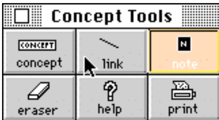
Figure 2: The original palette of the concept mapping tool

The concept mapping tool was linked to the button labelled concept map. This tool contained a pop-up palette of six buttons which appeared once the concept map button was activated. The six buttons employed by the concept mapping tool mirrored the process recommended by White and Gunstone (1992) and the arrangement of the buttons in the palette was made to follow the instructional sequence which they also recommended. This palette is shown in figure 2.