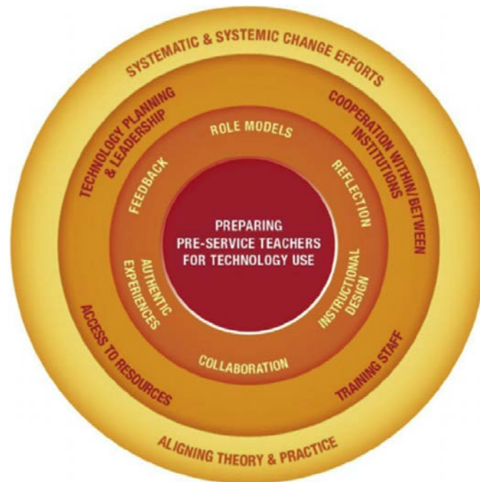
Figure 1. SQD-model to prepare pre-service teachers for technology use (Tondeur et al., 2012)

According to the findings of this review, 12 key themes need to be in place in the teachers' education programs to prepare future teachers for technology integration. The two outer circles in the SQD-model include the conditions necessary at the institutional level such as technology planning and leadership, training staff, access to resources, cooperation within and between the institutions. The two inner circles include micro-level strategies such as using teacher educators as role models, and scaffolding authentic technology experiences. These six strategies at the micro-level were examined in this study.