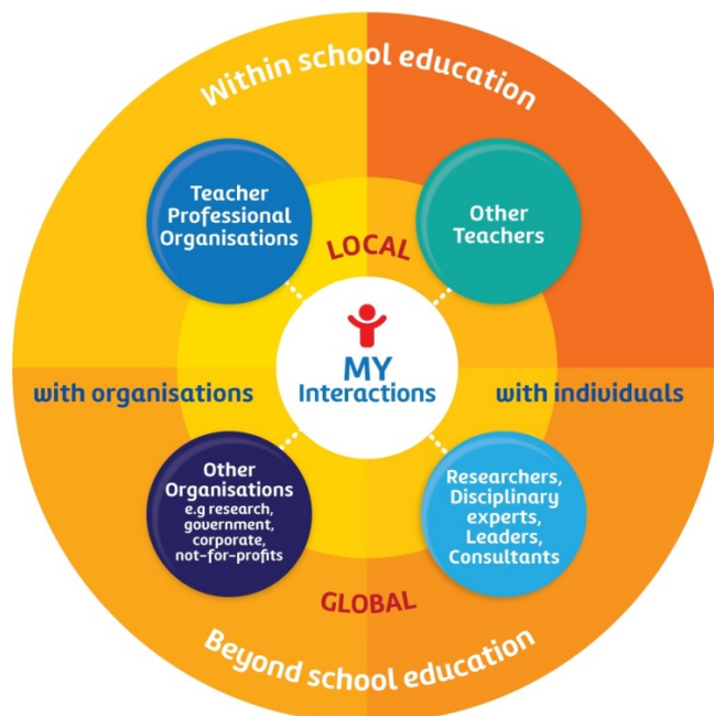
Figure 1. PLNs from a teacher's perspective. (From Kearney et al., 2016, p. 31)

In response to growing evidence of ineffective formal professional learning strategies for teachers, especially traditional top-down approaches underpinned by transmissionist strategies, such as staged workshops led by external experts (Beauchamp, Burden, & Abbinett, 2015), teachers' use of less formal, typically self-initiated PLNs has been espoused as a more collaborative, autonomous option and worthy of further research (Kearney, Schuck, Aubusson, & Burke, 2017; Visser et al., 2014). Teachers' use of PLNs offers a more flexible approach for professional learning, in collaboration with (local and global) teacher peers and other experts, as well as key organisations within and beyond school education contexts, as depicted in Figure 1 (Kearney, Pressick-Kilborn, & Hunter, 2016).