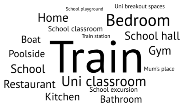
Figure 3. Settings where study participants ( n = 11 ) used their m-devices to participate in their PLNs. Note. The size of each word in this figure is commensurate with how often it was mentioned by PSTs in study data.

Exploiting the m-device's portability, the PSTs enjoyed high levels of agency over where and when they participated in their PLNs. They chose a range of settings and times to engage in their PLN, typically using their m-devices during in-between times, in both formal (e.g., university classrooms) but more typically informal contexts such as home and on public transport (Figure 3). For instance, Caroline mentioned in her focus group: "I find it really convenient. I've always got my phone on me. I am always using Facebook and Twitter and LinkedIn. I use it mainly on trains and at home."