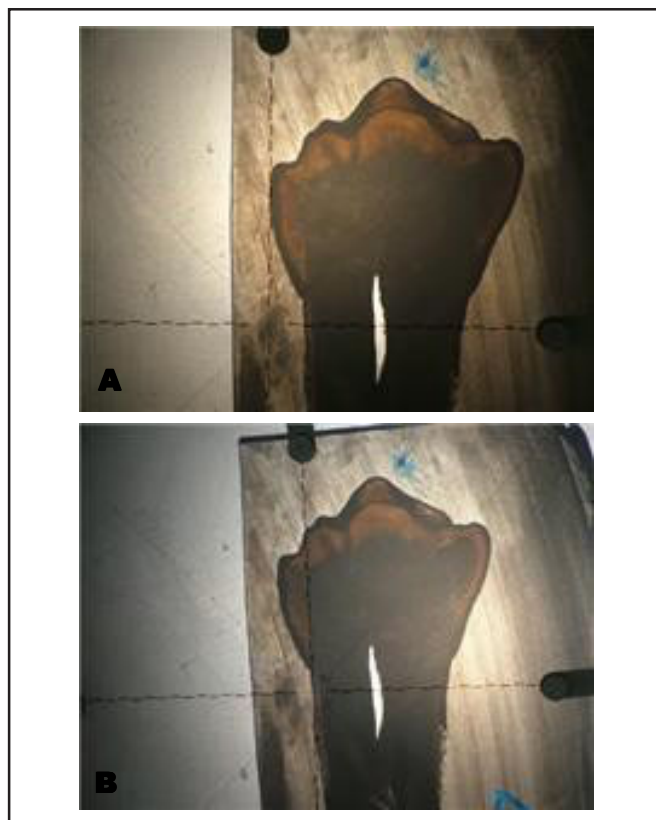
Fig. 5 – Projected image on the profilometer for measuring enamel thickness (A and B).

Minimum, maximum and mean values, as well as standard deviations and coefficients of variation for the crown measurements and enamel thicknesses of maxillary first premolars are shown in Table 1. The greatest mean value was observed for the buccolingual crown measurement, followed by the cervico-occlusal and mesiodistal dimensions.