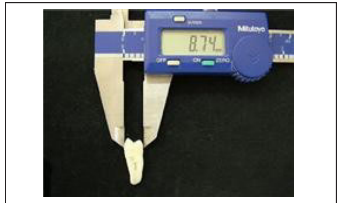
Fig. 2 – Measure of the tooth crown buccolingual dimension.