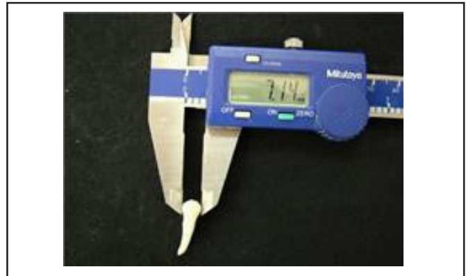
Fig. 1 – Measure of the tooth crown mesiodistal width.

All teeth were kept in a fixed position in rectangular plastic flasks using utility wax and embedded in acrylic resin (ARAZYN 1.0 – Redelease®, São Paulo, SP, Brazil). Tooth sections were obtained using a diamond disc in a trimmer Lab Cut® 1010 (Extéc® Corp., Enfield, CT, USA), under