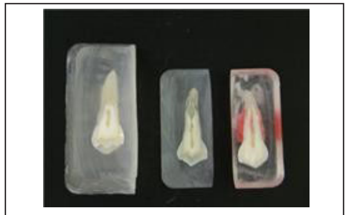
Fig. 4 – Resin block sectioned with the tooth 1-mm-thick cut central section.