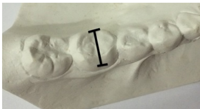
Fig.2. Buccolingual/Palatal distance.