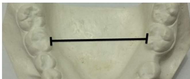
Fig.3. Distance between the lingual cusps of the molars in opposite quadrants.