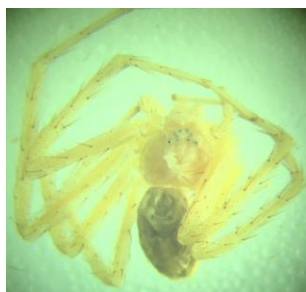
(A) P. cespitum