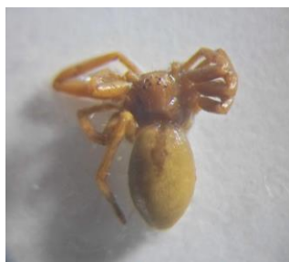
(G) T. imbecillus