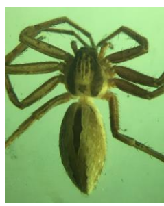
(F) T. formicinus