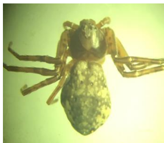
(B) P. emarginatus