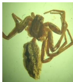
(I) T. vulgaris

Plate (2): The general view of described species of Philodromidae