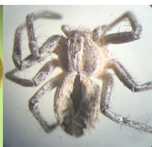
(E) T. atratus