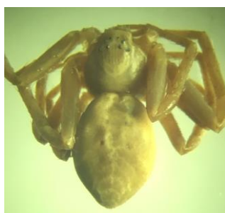
(D) R. histrio