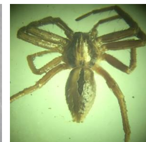
(H) T. pictus