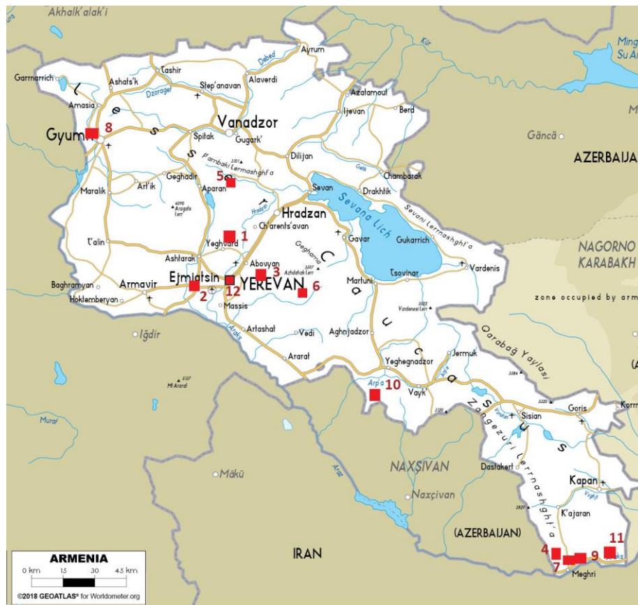
Map (1): Collecting localities. 1. Ara ler (mount Ara), 2.Ejmiazin, 3.Geghadir, 4.Gudemnis, 5.Hankavan, 6.“Khosrov forest” State, 7.Lehvaz, 8.Marmashen, 9.Meghri, 10.Noravank, 11.Shvanidzor, 12.Yerevan.