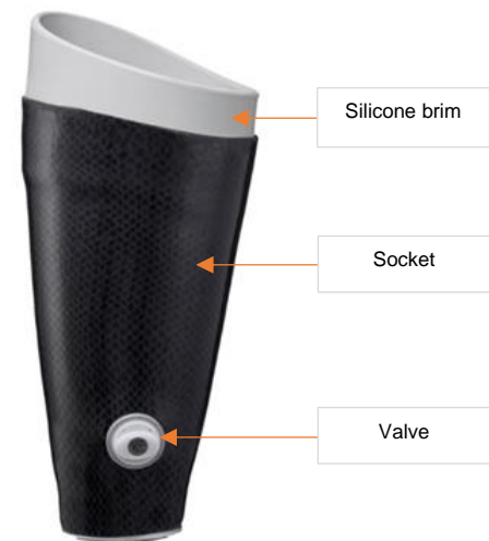
Figure 1: Direct Socket

The selection criteria for study principle investigators included a Certified Prosthetist (CP) with more than 5-years clinical experience in serving TF amputees with interest in improving patient outcomes and satisfaction, willingness to follow a defined novel fabrication protocol, and commitment to document outcome measures at defined time intervals. The inclusion criteria ( rationale ) is listed in Table 1.