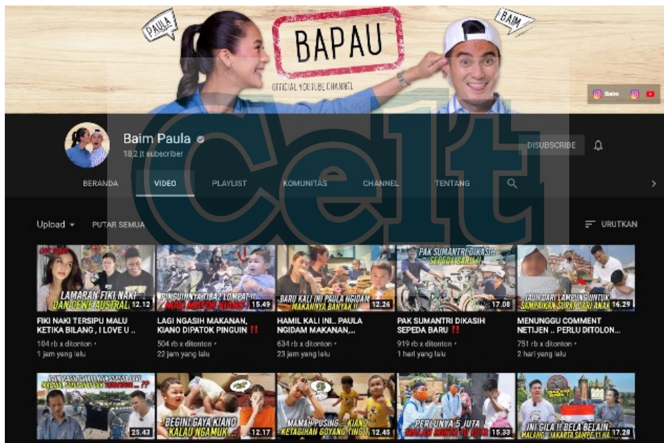
Figure 6: BAPAU's family YouTube channel