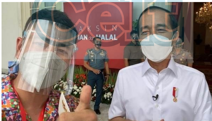
Figure 2: Raffi Ahmad with President Joko Widodo (27th January 2021,)

Raffi Ahmad and Nagita Slavina are establishing themselves as Insurgents on YouTube, but they are also Incumbents in the Entertainment industry. Positions in entertainment, such as a well-known celebrity, become symbolic capital. Because social capital is "governed by the logic of knowledge and acknowledgment," it can be referred to as symbolic capital (Bourdieu, 1986 in Johnson 2016). Raffi Ahmad's symbolic capital will be revealed in January 2021, when he is trusted to be one of the celebrities who received the COVID-19 vaccination.