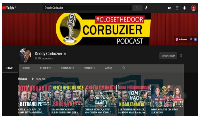
Figure 3: Deddy Corbuzier YouTube channel

The next observation goes to Deddy Corbuzier's YouTube channel. He is well-known to the public as one of Indonesia's most popular magicians. He launched his YouTube channel in 2009 and began regularly uploading in 2011. He amassed 13.9 million subscribers and 814 videos in less than ten years. Deddy's content is primarily focused on podcasts, motivation, strategic fundamental combat tips, and his various perspectives on current events. Each day, he uploads one video.