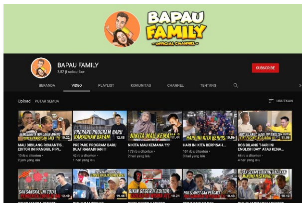
Figure 7: Baim and Paula's second YouTube Channel

Next, the researchers observed through Baim Paula's uploaded content that the most popular videos on YouTube were when Baim and Paula collaborated with Raffi Ahmad to conduct a social experiment in which he and Raffi were dressed as lunatics and observed how strangers reacted to them. Not only that, their daily vlogs detailing their daily activities and social interactions with other celebrities also encourage viewers to subscribe to their channel. The researcher noted that when Baim and Paula achieved celebrity, they collaborated with another influential and well-known celebrity, such as Raffi Ahmad. As a result, Raffi can increase the number of viewers on Baim Paula's channel.