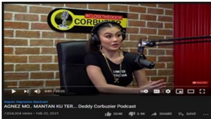
Figure 4: Deddy Corbuzier podcast with Agnez Mo