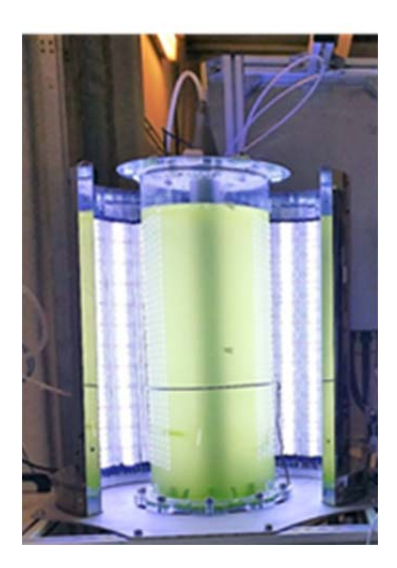
Figure 1: Picture of the photobioreactor used for microalgal growth

Scenedesmus Almeriensis inoculum was bought by Algares SrI (Rome, Italy). The culture medium used for the growth of the microalga Scenedesmus Almeriensis in the photobioreactor was the Mann and Myers's, while the inoculum starter used for experimental tests and deriving from Algares is reported in the Table 1. Monitoring of microalgal biomass growth was performed using a spectrophotometer. The used spectrophotometer was the Thermo Fisher Scientific Multiskan®, while analysis on the liquid phase was carried out by using Thermo Scientific Dionex<sup>™</sup> ICS-1100 Ion Chromatography System (Dionex ICS-1100) that performed ion analyses using suppressed or non-suppressed conductivity detection.