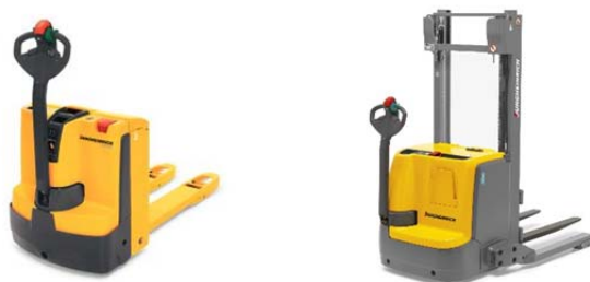
Figure 1: Types of pallet movers – left: standard pallet mover, right: stacker

Internal transport represents a well-known occupational hazard in many modern industrial environments. Pallet movers (Figure 1) are used for internal transport in several industries, and these machines are easy to operate, compared to for example forklift trucks. However, pallet movers are inherently dangerous machines. They often operate close to pedestrian workers, and charged with a load, their total mass can be well above two tons. Often, their load is not secured to the machine, leading to instability when gravity gets grip of the load.