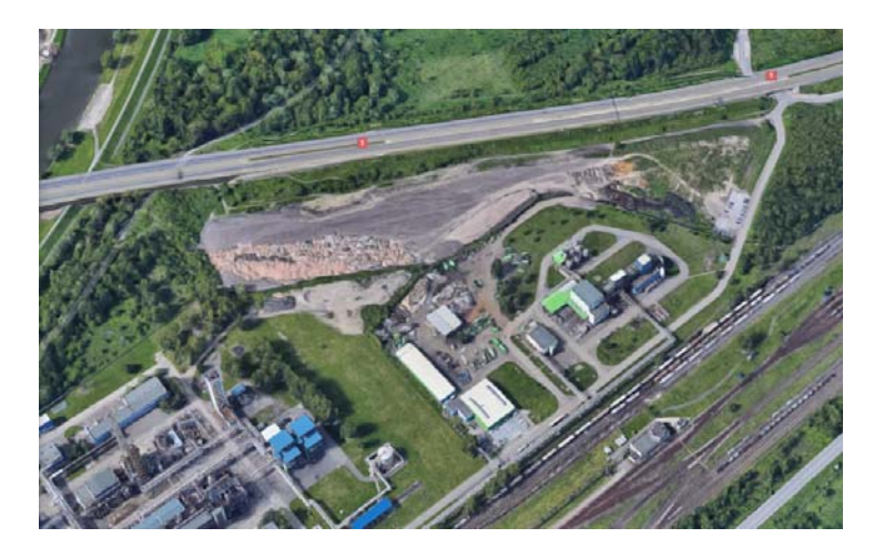
Figure 1: Location of the incinerator area and its surroundings

New SEVESO establishment, where hazardous wastes are stored and modified for purposes of their liquidation by combustion in the rotary kiln, was selected for purposes of this case study. The incinerator is designed for the safe disposal of hazardous wastes from industrial plants, allows the incineration of wastes of all states (see Figure 1). A characteristic feature of the industrial waste incineration process is the mixing of different types of waste to achieve the required combustion temperature (Silva and Lopes, 2017). Therefore, typical representatives of large amounts and most often imported hazardous wastes were selected.