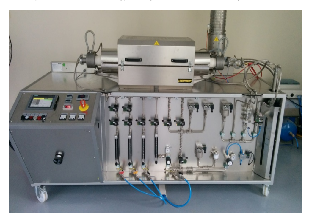
Figure 1: Nabrtherm chemical vapor deposition furnace for impregnating carbon into CCC.

Carbon-carbon composite samples with volume of 1 cm<sup>2</sup> were prepared from carbon cloth, nanographite and coal tar, which were carbonized at temperature of 950 °C and underwent a heat treatment process at 2,200 °C. Carbon deposition into the substrate of carbon-carbon composite was carried out in a Nabertherm chemical vapor deposition furnace with the chamber length of 1,000 mm and diameter of 5 mm at Vietnam Academy of Science and Technology with highest vacuum of 10<sup>-3</sup> Pa (Figure 1).