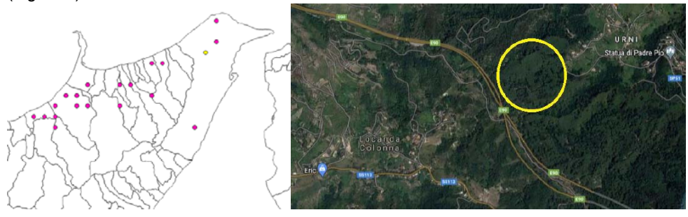
Figure 2 - Plant localization

The location of the plant is foreseen in an unprotected wooded area, sufficiently far from city centers, easily reachable through long-distance roads or suburban roads which if crossed by trucks do not affect city traffic (Figure 3).