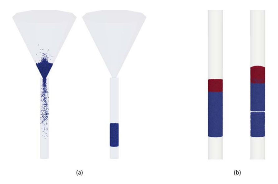
Figure 1: (a) Particles falling and stabilising in the DEM simulations; (b) onset of fluidisation in the CFD-DEM simulations (blue is glass while red is lead)

The pure DEM simulations focused on the stress distribution of 1.7 mm static glass particles in a 28-mm-diameter cylindrical column. Particles were gradually let into the column through a funnel, until they settled under the effect of gravity. After the system had stabilised, the stress distribution was analysed through the values of the contact forces. To force the particles into reaching the active state, the lateral wall was then let move upwards for 1 s with a velocity of 1 mm/s. After this, the stress distribution was analysed again. The CFD-DEM simulations regarded the water fluidisation of 1.7 mm glass and lead particles in a 30-mm-diameter column. The geometry was discretised in a cut-cell cartesian mesh with a size of 4 times the particle diameter, in accordance with common heuristics (Boyce et al., 2015). At the beginning, particles were settled at the bottom of the column and completely segregated, with the layer of lead particles placed above the layer of glass particles. Water was let flow from the bottom of the column at gradually increasing velocity. The pressure drop at the bottom of the column was measured after it had stabilised, for each inlet velocity value.