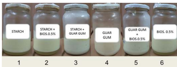
Figure 1: Mayonnaise sauce formulations, in the application of the biosurfactant produced by C. guilliermondii with medium supplemented with 5% molasses, 5% corn steep liquor and 5% residual frying oil, as a food additive, after 30 days in refrigeration.

The mayonnaise formulations and their behavior during the four-weeks assessment. The formula containing the biosurfactant from C. guilliermondii at a concentration of 0.5% with the addition of 0.5% guar gum was selected to prepare the formulation of six different mayonnaise sauces. In the first week, formulas 1 and 2 exhibited phase separations (Figure 2), with visible aqueous phase at the bottom of the container. In the second week, formula 6 also exhibited phase separation. It is important to highlight that the use of isolated biosurfactant in sample 6 was not able to maintain the emulsion for 30 days. This could be explained by the difficulty in stabilizing the formula due to a large number of microstructures made up of proteins, carbohydrates and lipids combinations found in food (McClements et al., 2017). Formula 5 present to be the most creamy and stable, with higher resistance to shear and firm consistency and texture. The other formulas exhibited modifications in consistency and texture.