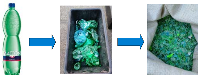
Figure 2: Illustration of PET processing from bottles (municipal waste) to shredded flakes (extrusion input)

The sorting was followed by shredding the material. Shredding took place on a hammer shredder. Several different screens with meshes of 20 mm, 10 mm, 4 mm and 2 mm were used for shredding tests; an illustration of the shredder including a cyclone and an example of screens is shown in Figure 3.