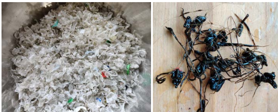
Figure 5: On the left, there is an unwashed transparent PET (extrusion input); on the right, unusable extrusion output degraded by impurities