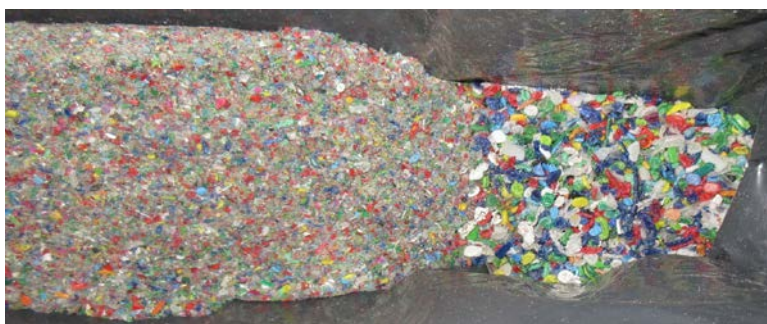
Figure 4: Example of under 4 mm fraction (left) and a reduced waste fraction (right), illustration of shredding on 4 mm mesh - HDPE material

The third experiment was based on a very small fraction (below 4 mm, sometimes even powdery grit). During shredding of waste plastics, there was a great limitation, especially in the case of the hammer shredder, when it was not possible to shred all the examined material through a fine sieve (2 mm). Therefore, two fractions were formed, one so-called subscreen and one above the screen (Figure 4). It should be noted that the "above the screen" fraction was also reduced to about 5 - 7 mm. This mixture was relatively suitable for self-dosing.