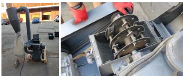
Figure 3: Hammer shredder with cyclone (left), detailed view of the shredder with 2 mm mesh (right)

Due to the comprehensiveness of measurements and tests, the processing will be demonstrated only for PET, and the main problem parts will be identified. Extrusion was performed on a HAAKE laboratory single screw extruder, screw diameter 19 mm, L / D = 25, screw compression 1: 4.