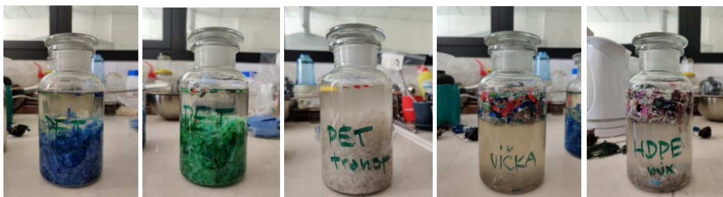
Figure 7: Demonstration of leaching of different types of plastics (PET blue, PET green, PET, HDPE bottle cups, HDPE mix) – a preparation for the subsequent experiments

Through experiments, it was found that there is potential for effective material recycling and thus compliance with the conditions of the circular economy. Further, very detailed research is needed to specify at what cost and how difficult it is to deal with the production of plastic secondary materials from municipal waste. In further research, extrusion will be tested at least for all fractions listed at the beginning of part 3. The subject of the planned tests will be primarily the requirements for the size of the fraction and the purity of the flakes. Figure 7 shows the ongoing preparation for further tests, i.e. the illustration of leaching, which will be followed by drying of the shredded samples.