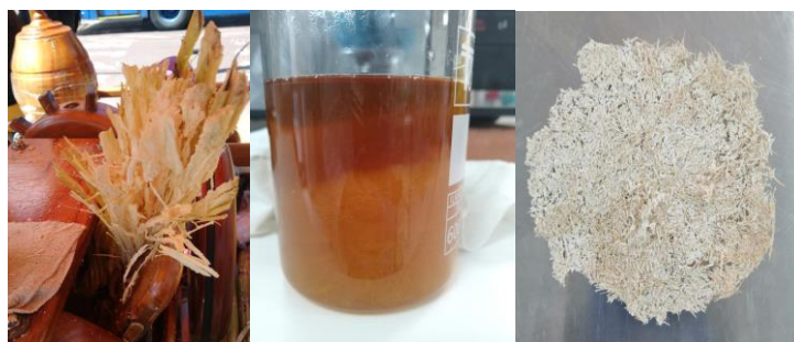
Figure 1 Sorting and extraction of cellulose fibers

The cane bagasse fiber was treated in the route I with 13 grams of 20 mesh, using water as solvent. This solution was manually agitated maintaining a range of 50 °C for one hour, then it was washed with water in excess to neutralize the pulp and was left to dry for 24 hours at 50°C. Once the pulp was dry, the alkaline hydrolysis was carried out using NaOH 5 % w/v, with constant agitation and following the same steps of the previous hydrolysis, taking into account the temperature of 70 °C in this case. Route II was carried out in the same way as the previous one, changing the concentration of the acid hydrolysis to 1% v/v. These changes in concentration are associated with obtaining fermentable sugars from lignocellulosic compounds, in which the acid hydrolysis must be diluted to avoid the denaturation of the compound, allowing its main use in the production of bioethanol thanks to the solubility of hemicellulose and lignin. (Chandler et al., 2012). Finally, route III was carried out by performing the alkaline hydrolysis based on the same concentration contemplated in the route I and II, which is very similar to the Kraft process. After the chemical process routes were carried out, the pulp was dried to obtain a filter media of approximately 1 gram, as can be seen in Figure 1.