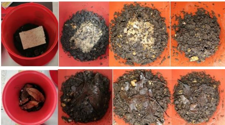
Figure 4. Filter media in vermicomposting; dry leaves in vermicomposting.

Finally, in 26 days, the filter media was totally transformed into organic fertilizer when digested and transformed by the enzymes of the earthworms and 60% excreted. (Mikolic et al., 2018), providing a new sustainable product. The opposite is the case with dry leaves because their stalk does not disappear since it is not feasible for feeding due to its rigidity.