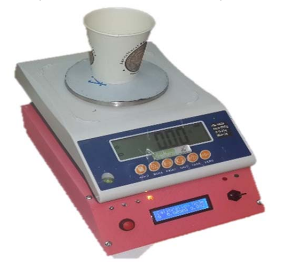
Figure 1: The smart scaling system prototype.

A prototype of smart scaling system based on the developed algorithm and methodology was developed (Figure 1). The system consists of: i) a digital scale with accuracy of 0.01 g; ii) a controller with the scaling algorithm; and, iii) a visual and sound interface. The system operates in two modes: a) calibration mode – to find the critical weight based on the model and package characteristics; and b) weighing mode – the flower cuttings are loaded on the scale until it reaches the critical weight. The visual – sound interface marks when the weight reaches 90% of the critical weight and at the critical weight.