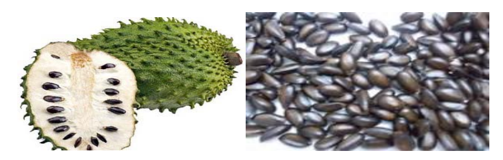
Figure 1: Soursop fruit and seeds