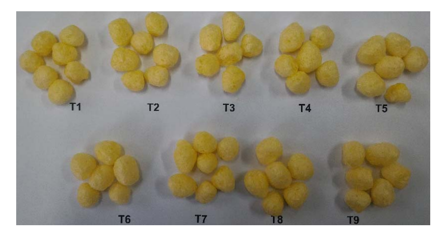
Figure 2: Photographs of the produced samples.

The samples subjected to the nine different treatments appeared homogenous and presented no visual differences among each other, see Figure 2.