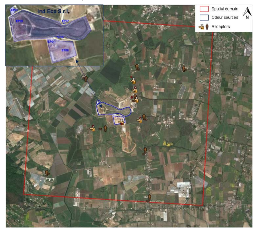
Figure 1 – Spatial domain, odour sources and receptors

Research studies were conducted at a non-hazardous waste landfill, located in the municipality of Latina, Lazio Region (Middle Italy). The landfill is approximately located at 11.5 km from the centre of the town (Figure 1). The investigated plant consists of five basins. Four basins are used in the post-management phase and are permanently covered, while one is used in the operating phase. The main activities of the post-management basins consist of: management and control of the drainage system and leachate collection; management and control of the collection system and biogas combustion; management of human and technological resources available at the plant. While, in the active basin, the operating cycle provides the following steps: weighing, inspection and acceptance or refusal of the waste; transport of waste to the landfill under management; waste disposal; transit of vehicles; management and control of the drainage system and leachate collection; management and control of the collection system and control of the drainage system and leachate to the landfill under management; waste disposal; transit of vehicles; management and control of the drainage system and leachate collection; management and control of the collection system and combustion of biogas; management of human and technological resources available at the plant.