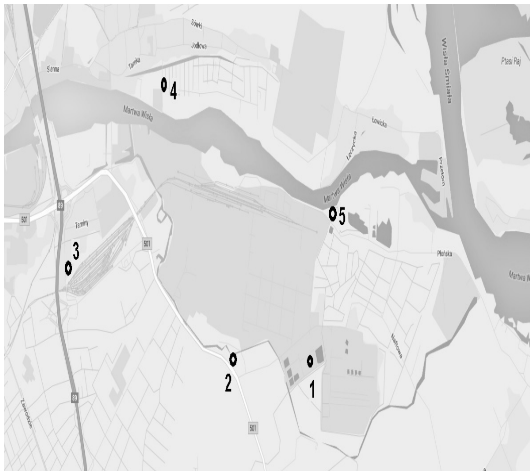
Figure 2: Localization of each sampling point.

The ambient air samples collected in a vicinity of the LOTOS Group S.A. petroleum plant were used for investigation of air quality with respect to odour. They were collected at 5 control points localized in the places where the petroleum plant was conducting continuous monitoring. Localization and distribution of the ambient air sampling points around the petroleum plant are illustrated in Figure 2.