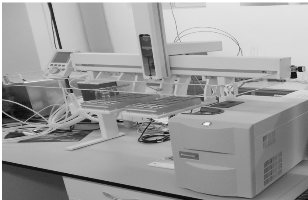
Figure 1: Electronic nose of Fast GC-type - HERACLES II.