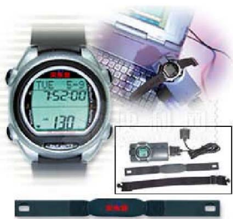
Figure 1: PE-Sport2000 heart rate measuring instrument

Test equipment including: domestic car, Micro printer, PE-Sport2000 heart rate measuring instrument, mainly composed of four parts, heart rate watch, heart rate emission band, computer converter and with 25 pin connector of the cable, as shown in figure 1. The heart rate is used to transmit the heart rate, the heart is close and comfortable to wear in the driver's chest; heart rate watch is used to receive the heart rate, the driver should wear the wrist, real-time collection of the driver's heart rate; the experiment can be used to transfer the heart rate data into the computer. BD- -510A type reaction time measuring instrument produced by Chinese company, which to determine the driver's choice reaction time and simple reaction time, test the driver's reaction speed.