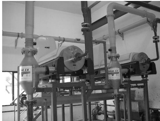
Figure 2: Centrifuges for dewatering sludge

Another parameter which can affect the efficiency of the recirculation of sludge may be due to geological characterization of the watershed from which the water outlets for purification, especially the type of silt and clay in the mixture. For this reason, the recirculation of sludge in the PWTP should generally be ignored and the future designs of such facilities should then systematically consider sending thickened sludge dehydration directly without recirculation.