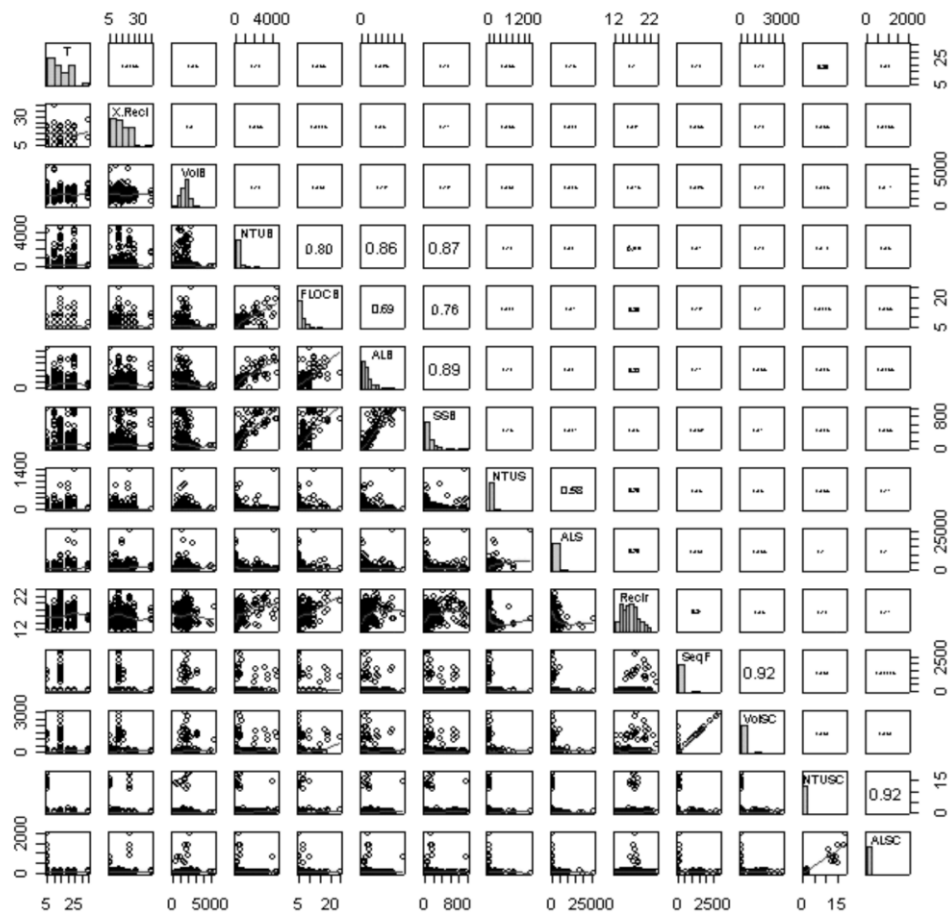
Figure 3: Multivariable correlation of the variables used in the process in relation to the different times and recirculation values