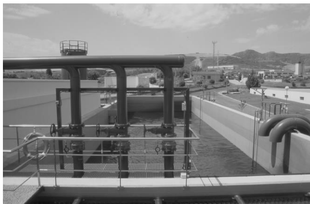
Figure 1: Homogenization tank for the PWTP of Logrono

Moreover, part of the thickened sludge was recirculated through two electric pumps of eccentric theme of variable flow in order to increase process efficiency.