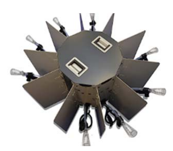
Figure 1: A picture of the eight position dynamic olfactometer ( Wolf)

Figure 1 shows a picture of the new eight position olfactometer, named Wolf.