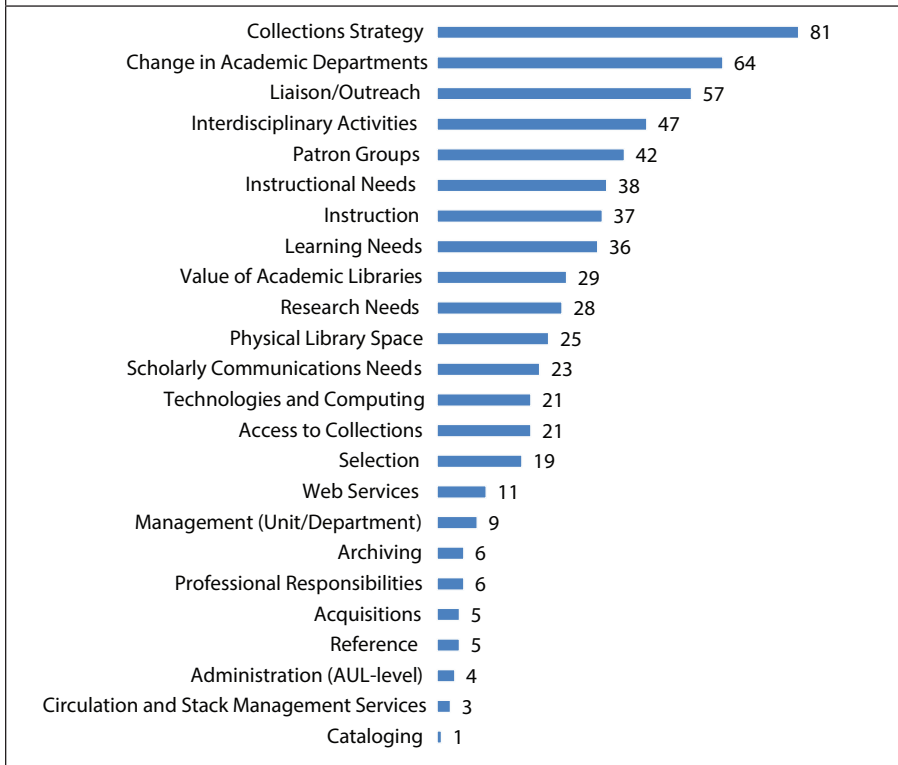
FIGURE 3 Common Themes in Academic Program Review Reports Relevant to Academic Libraries

In another quantitative analysis, we counted the co-occurrence of themes (see figure 4). If one theme typically co-occurred with another theme in our liaisons' findings, this might reveal relationships among the priorities. The co-occurrences point to the intersections of issues as well as potential collaborations between working groups. For instance, we observed a high level of co-occurrence between the two themes of Collections Strategy and Change in Academic Departments and between the themes of Collections Strategy and Interdisciplinary Activities. Upon closer review, this indicated a need for collections development that addressed the increasingly interdisciplinary activities that academic departments are engaging in. Additionally, we learned that change in academic departments is primarily understood by liaisons in terms of interdisciplinary activities, patron groupings, and evolving strategies for collection development, where there are the most thematic co-occurrences. These quantitative analyses reveal patterns in the themes and offer a sense of their priority.