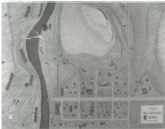
"Big Inning," rendering of the fictional town of Big Inning, Iowa.

two earlier classes on baseball stadium design, set the stage for this unusual course. In 1997, they also collaborated on another course. This summer class focused on horse racing, and led students through the creation of a horse barn and related structures. Llanes and Brown are also at work on a documentary film project that traces