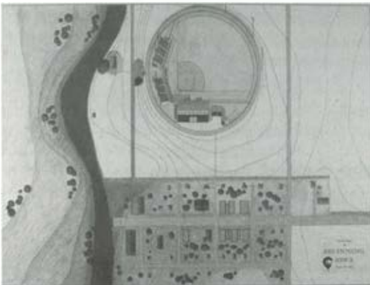
“The Circle,” rendering of the proposed stadium—student project.

The Iowa Baseball Confederacy proved an excellent choice for the architectural studio. By combining elements of fact and fiction, of contemporary time with a bygone era, this volume set the stage for an architectural odyssey that concluded at the National Baseball Hall of Fame and Library in Cooperstown, New York.