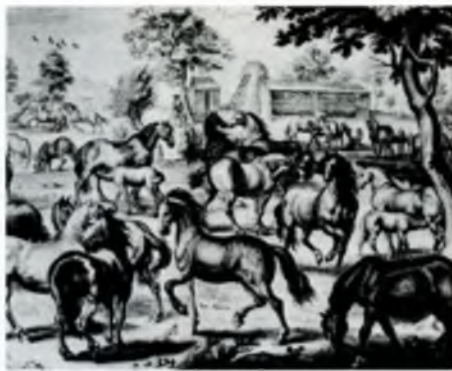
This illustration is from the Duke of Newcastle's Methodes et Inventiones Nouvelles de Dresser les Chevaux (Antwerp, 1657), one of the highlights of the National Sporting Library's new von Hunersdorf Collection.