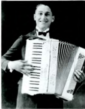
Lawrence Welk and his accordion, circa 1938.